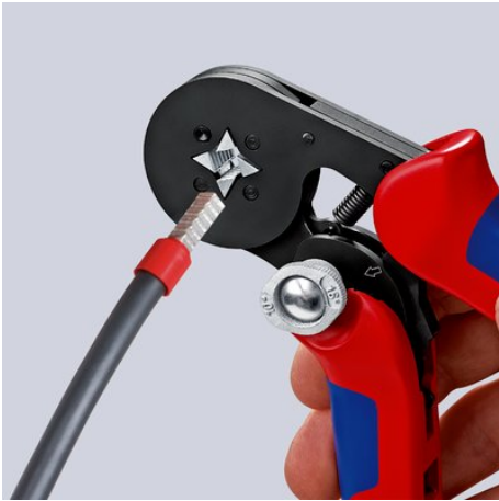
Crimping capacity can be switched over simply from 10 mm 2 to 16 mm 2 .